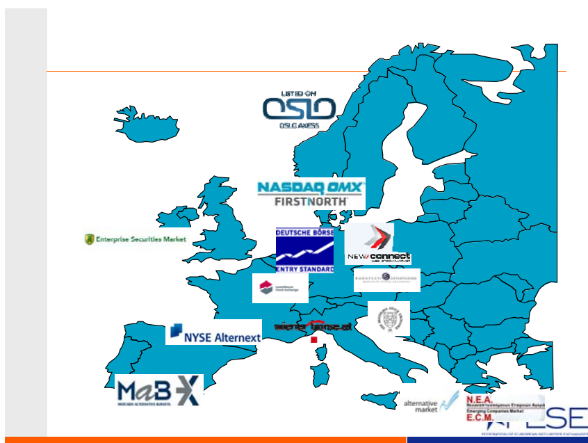
Chart 1: Financing for SMEs via MTFs operated by FESE Members

For the efforts of the listing venues to bear fruit, however, the local ecosystem must be there to help companies access markets, the companies themselves must want to list and investors must be willing to invest in SMEs.